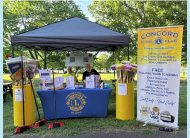
Broom Sales at the Farmers' Market