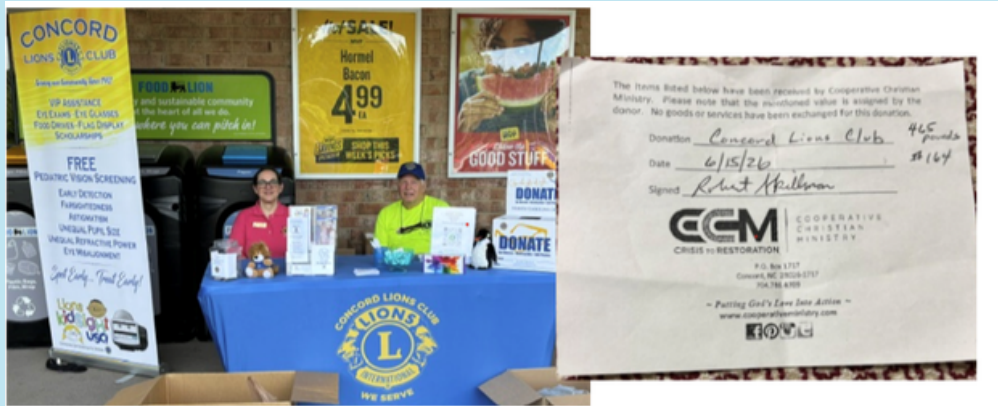
Food Drive for Cooperative Christian Ministries 465 pounds plus $164 in donations!