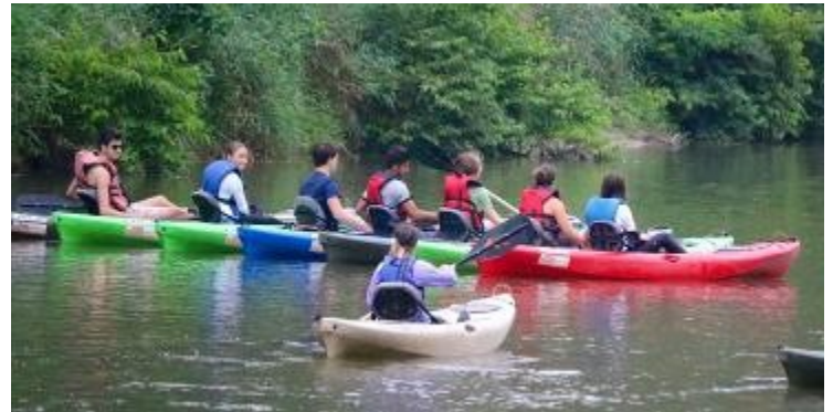
Kayaking on the New River while visiting the Sparta Club