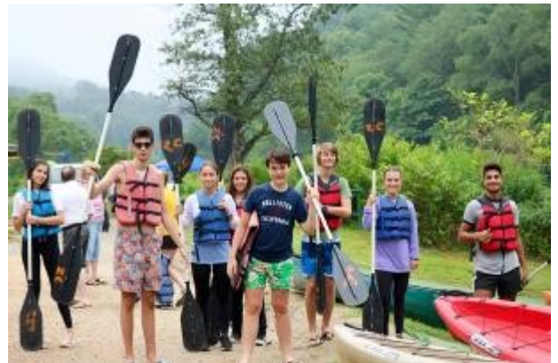
New Bern > Outer Banks > Lake Gaston > Winston-Salem