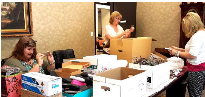
Lexington DownTown Lions sort and pack glasses and ink jet/toners collected by the club to be delivered to Camp Dogwood for recycling and to benefit NC Lions Inc.

Cases are not needed. Broken plastic frames and lenses not in frames are not used or recycled.