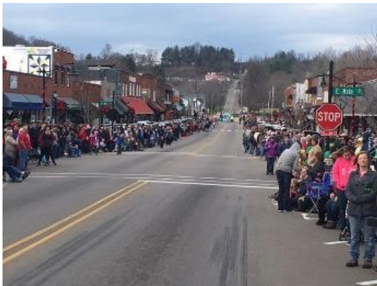
Left: The crowd awaiting a past West Jefferson Christmas Parade

When Veteran's Day is observed on November 12, approximately 200 American flags will be displayed in both West Jefferson and Jefferson.