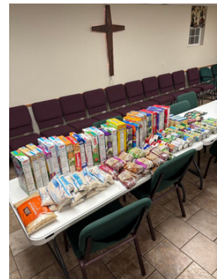
FCWC Food Pantry Collection

lions31newsletter@gmail.com, by the 20 th of each month.