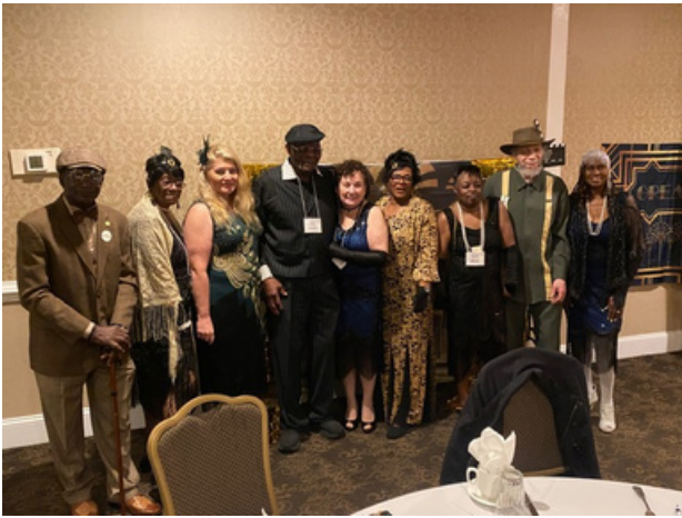
Nine members from Salisbury LC attended District 32-I Family Fun Night.