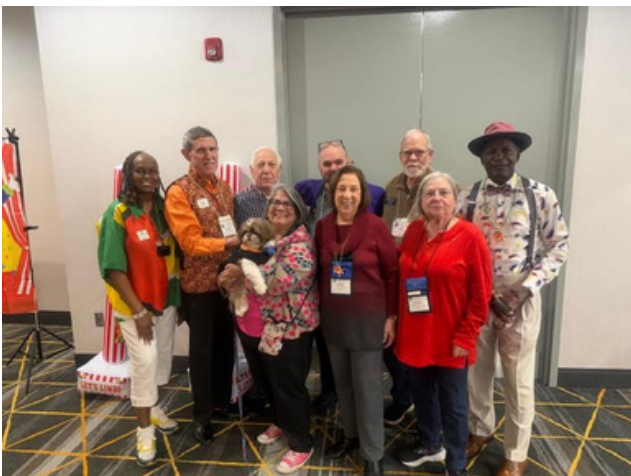
Nine members from District 31-I attended District N& S Convention Friday Fun Night.

Have a Story? The newsletter editor has a new email address. Please send your story with pictures attached to lions31newsletter@gmail.com , by the 20 th of each month.